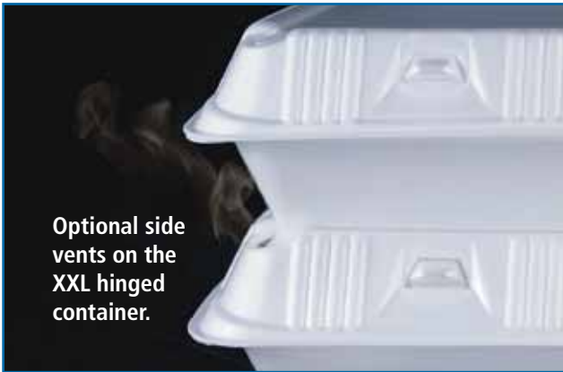
Optional side vents on the XXL hinged container.

Pactiv's SmartLock® Vented Foam Hinged Containers are ideal for transporting foods that need to stay fresh and hot. The side vents on the package allow steam to escape – perfect for such popular food items as chicken, fish, french fries, and other crispy foods. The unique venting system on the XXL SmartLock® Hinged Lid Container gives operators the ability to control the amount of escaping steam, even if stacking becomes part of the plan.