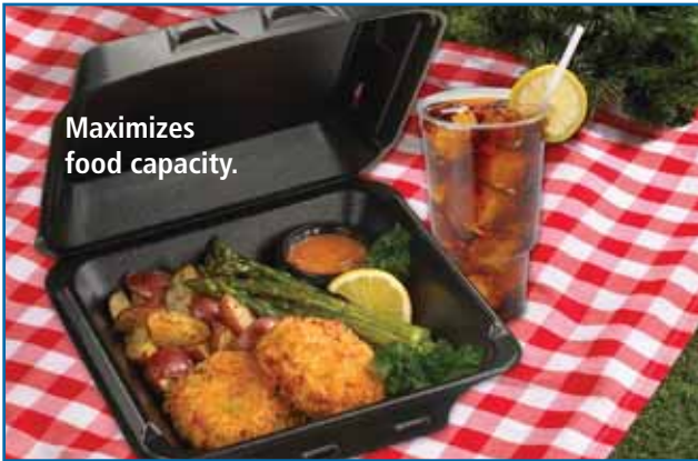
Maximizes food capacity.