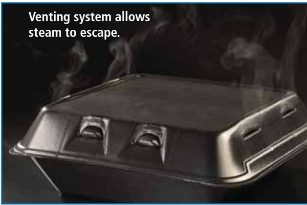
Venting system allows steam to escape.