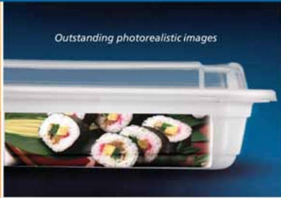
Outstanding photorealistic images