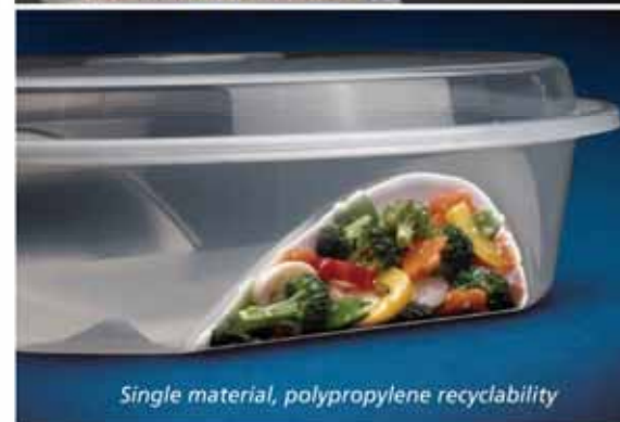
Single material, polypropylene recyclability