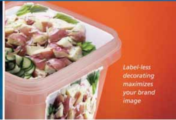
Label-less decorating maximizes your brand image