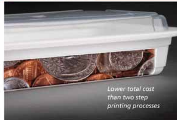
Lower total cost than two step printing processes

Label allows print fonts as small as 4 point to be read with ease