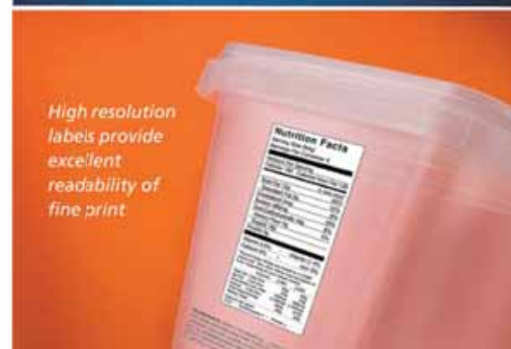
High resolution labels provide excellent readability of fine print