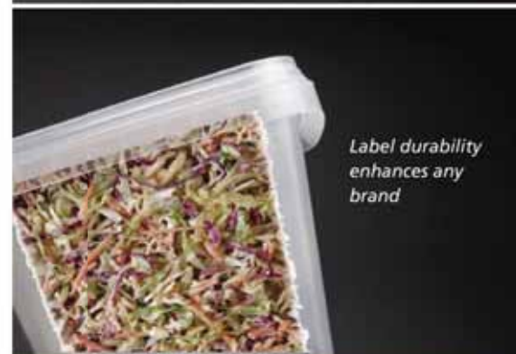
Label durability enhances any brand