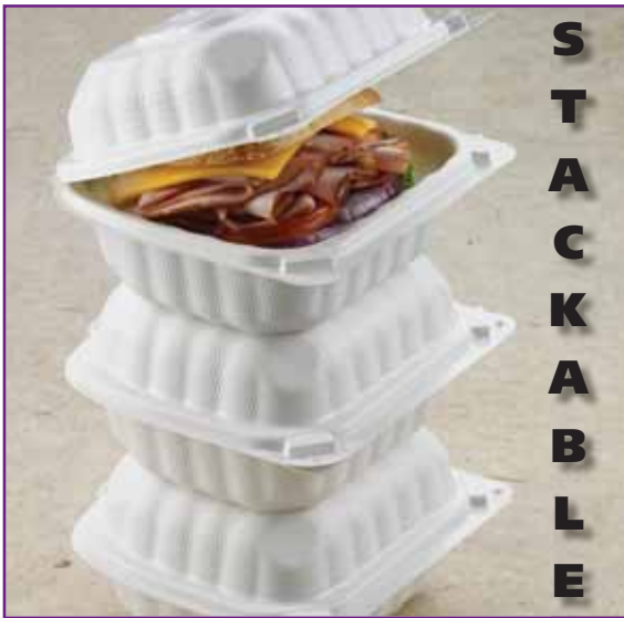
SmartLock® Closure System