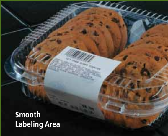
Smooth Labeling Area