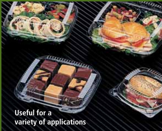
Useful for a variety of applications