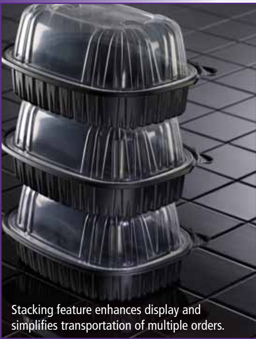
Stacking feature enhances display and simplifies transportation of multiple orders.

The new ClearView™ MealMaster™ Medium Tamper Evident Chicken Roaster with co-extruded Fog Gard™ gives you all the features you've come to expect from Pactiv, and a great deal more – venting, and a new Tamper Evident Closure System that prevents leakage and enhances overall food safety.