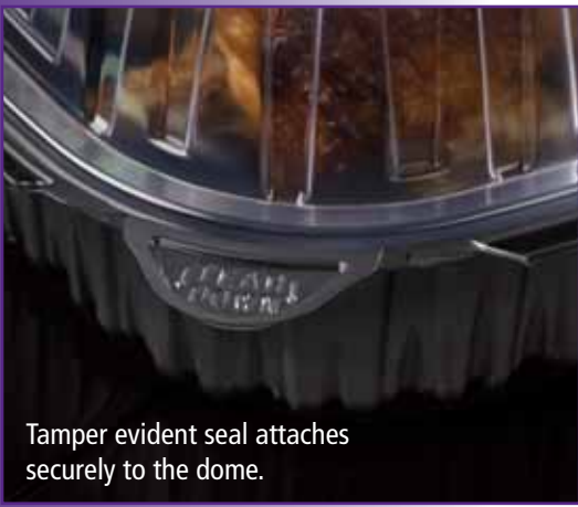
Tamper evident seal attaches securely to the dome.