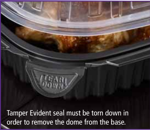
Tamper Evident seal must be torn down in order to remove the dome from the base.