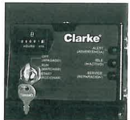
Control panel lights inform operator of emissions controls and engine performance. Planned maintenance intervals are easily monitored with the on-board hour meter and the standard key-ignition switch prevents unauthorized use.