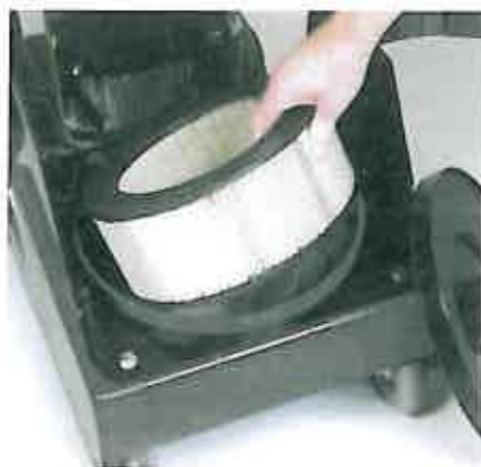
Automotive style air filter for improved indoor air quality. Dust Control system extends pad life by preventing particle build-up in the pad.