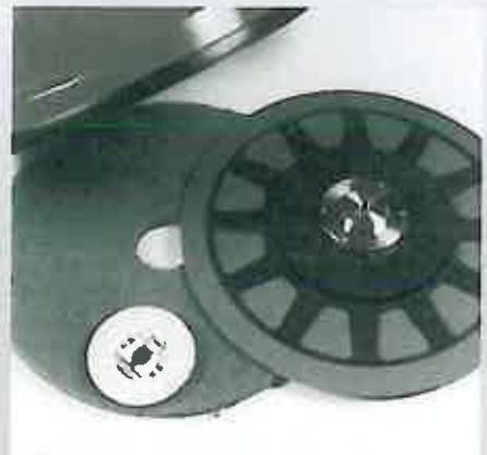
Balanced pad drivers reduce vibration and are flexible to follow the contour of uneven surfaces over floors.