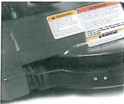
The Dust Control series offers a unique floating shroud that directs the high velocity airflow near the floor to collect six times as much dust as competitive models.