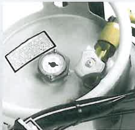
Large 20 lb. 80% safety fill propane tanks offers long working time between refills and also prevents overfilling.