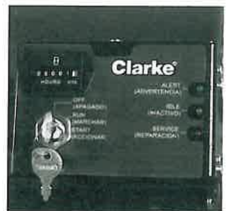
Control panel lights inform operator of emissions controls and engine performance. Planned maintenance intervals are easily monitored with the on-board hour meter and the standard key-ignition switch prevents unauthorized use.