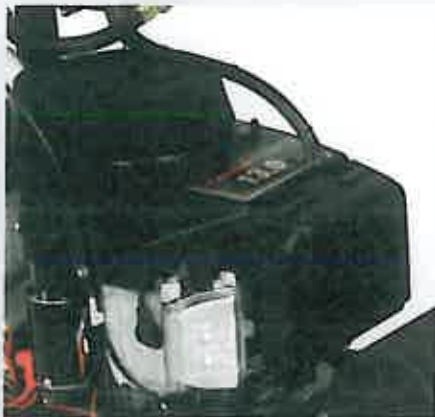
All models have Kawasaki Twin-V engines that provide maximum power.