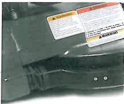
The Dust Control series offers a unique floating shroud that directs the high velocity airflow near the floor to collect six times as much dust as competitive models.