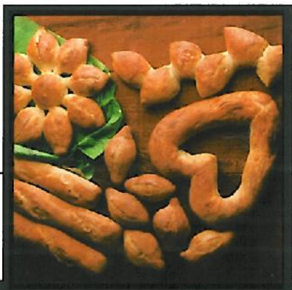
X-Large Bakery Bag