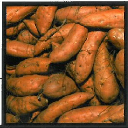
Ultra Tough GOLD Produce Bag