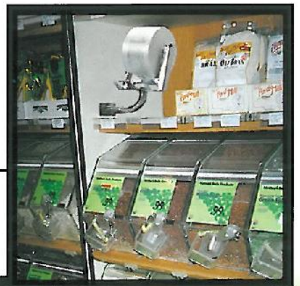
Bulk Products Bag