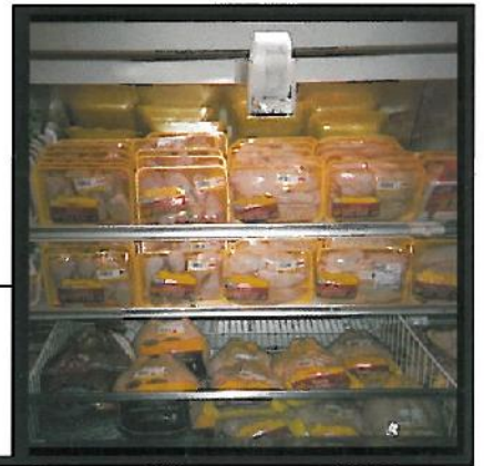
Meat & Poultry Bag