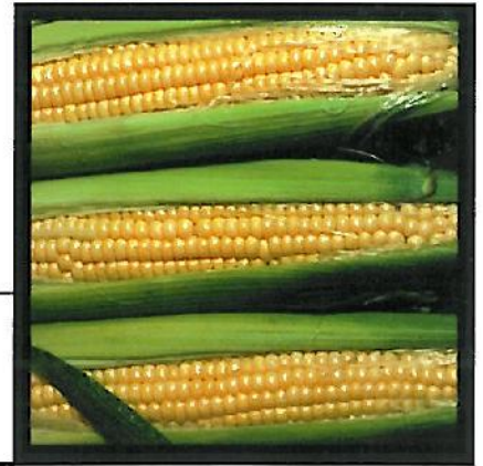
Fresh Corn Bag