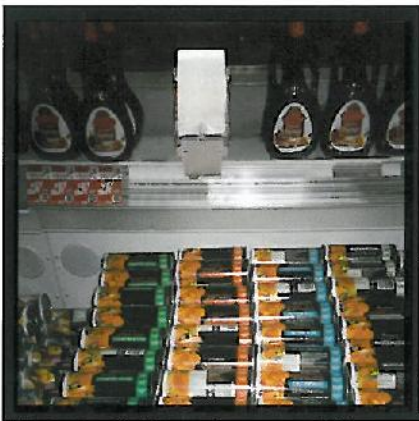
All-Purpose Frozen Food Bag