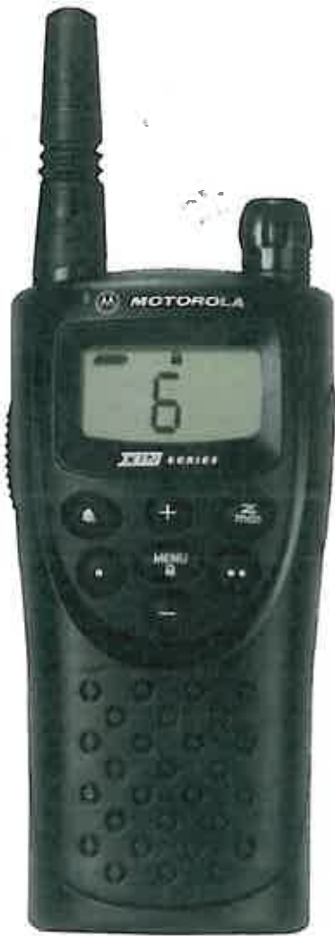
XTN Series Business Two-Way Radio