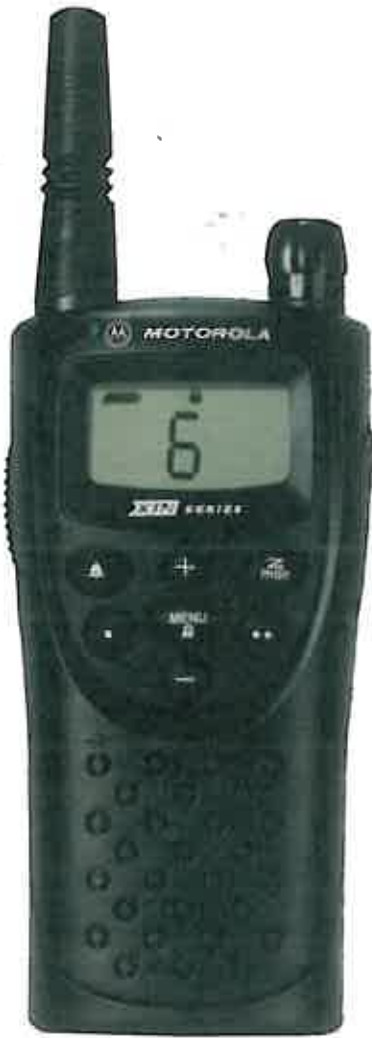
XTN Series Business Two-Way Radio