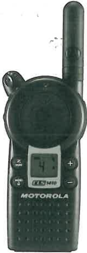
CLS Series Business Two-Way Radio