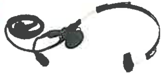
Headset with swivel boom microphone Part #53865

Convenient, hands-free use and clear reception in noisy work areas for non-stop productivity.