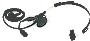
Headset with swivel boom microphone Part #53865

Convenient, hands-free use and clear reception in noisy work areas for non-stop productivity.