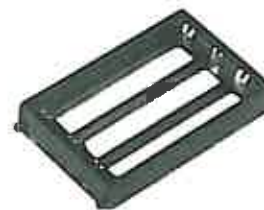
AAA Battery Tray Part # 56564

Alkaline battery capability provides an alternative to electrical recharging and adds flexibility to business operations.